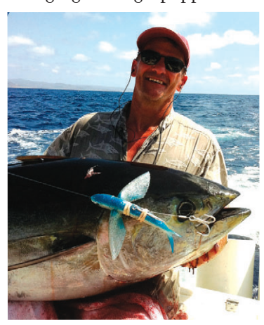
YUMMY FLYERS used with a kite and skipped are killer baits to cover ground, attract fish and hook them on heavier line.

This reel is going to turn some heads once it gets out on the market. There has already been some 300-pound-plus bluefin tuna caught using this reel on the East Coast. I remember back many years ago, we hard-core big-game saltwater anglers used to make fun of guys using coffee grinders (spinning reels), but not any more. Big high-performance spinning reels have definitely found their niche in the big game fishing community. For poppers, I've been using both the Savage gear large poppers and