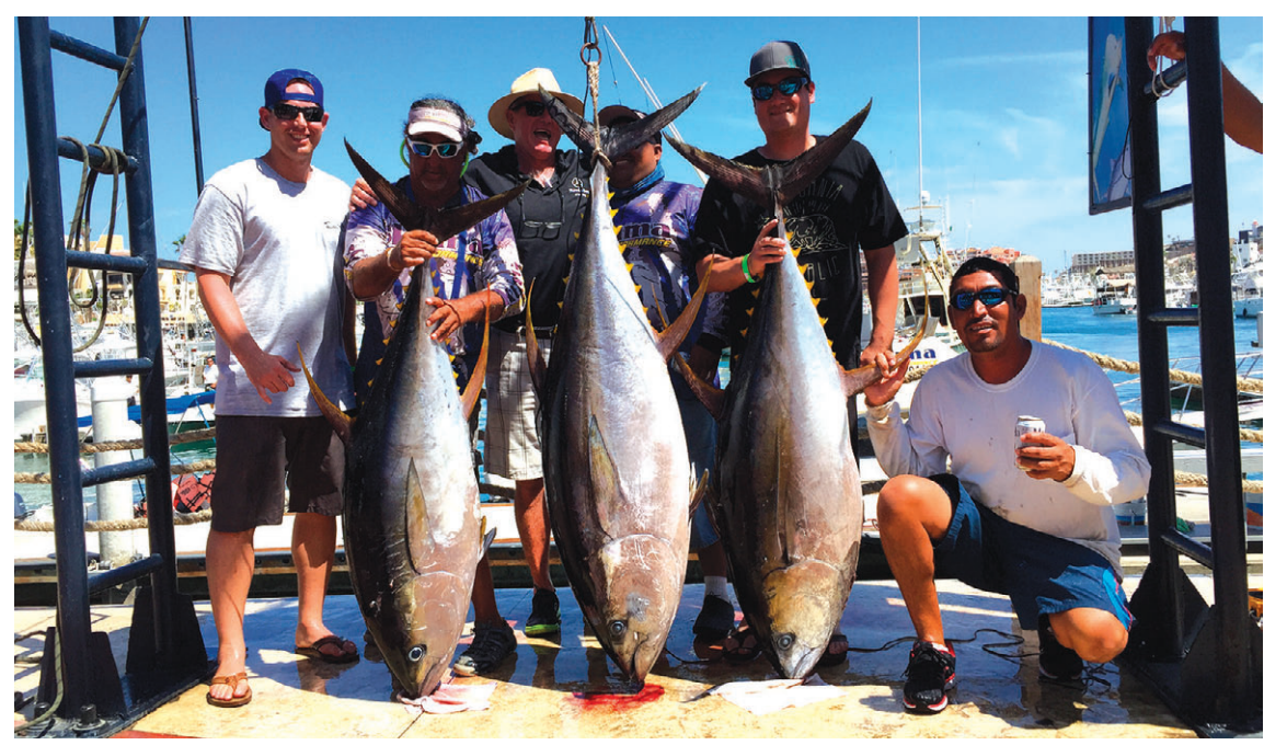
THAT'S A HELLUVA day on the water off Cabo for big yellowfin aboard Renegade Mike .

ular mono will work. You want to also use a swivel to keep your line from twisting, as the hooked chunk bait will spin when in the current and when bringing it back to the boat. I will run about a 4-foot piece of fluorocarbon in 80-, 100- and or 130-pound attached to your main line with the swivel. I like to crimp everything I can. The hook I use is a circle hook, and size depends on the size of your chunk bait. You want to completely bury the hook in the chunk bait. I like to run at least two chunk baits and one or two medium squid if you have it. I guess it depends on the size of your boat on how many you can run. I like to stagger them at different depths, so depending on the current I use torpedo sinkers. I may use a 3-ounce on one and a 5-ounce on the other. I just attach the sinker with a #64 rubber band about 15 to 20 feet up from your bait. That way you just pull the sinker off when your fish gets close to the boat.